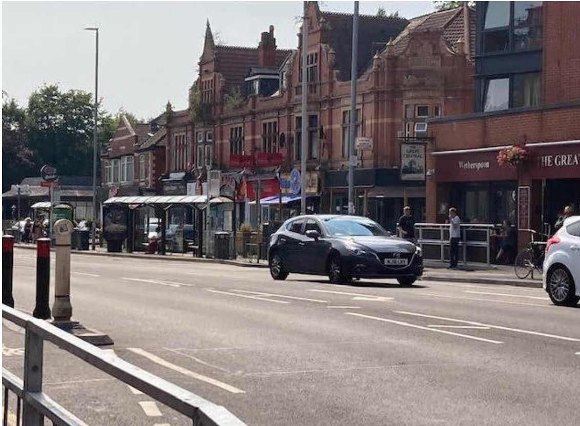
L. View of the end of Wynnstey Grove, including business and residential properties nearby.