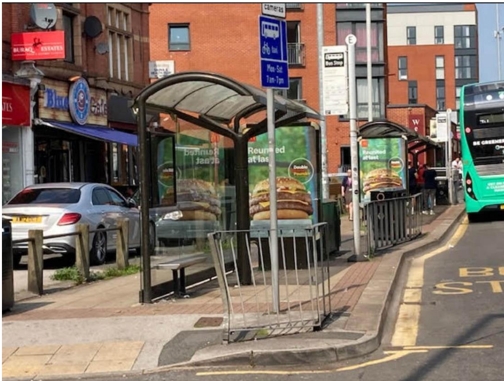
B. Bus stops on Wilmslow Road, next to the entrance to Wynnstay Grove