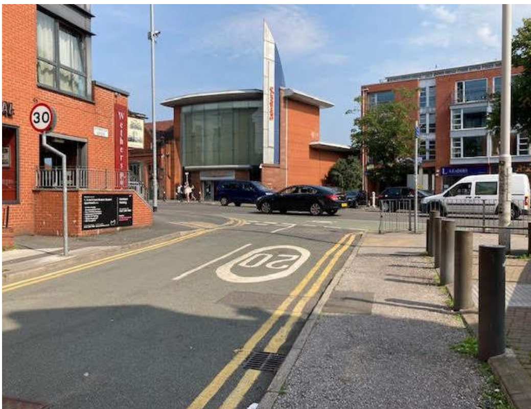
K. Top of Wynnstay Grove, looking towards Wilmslow Road