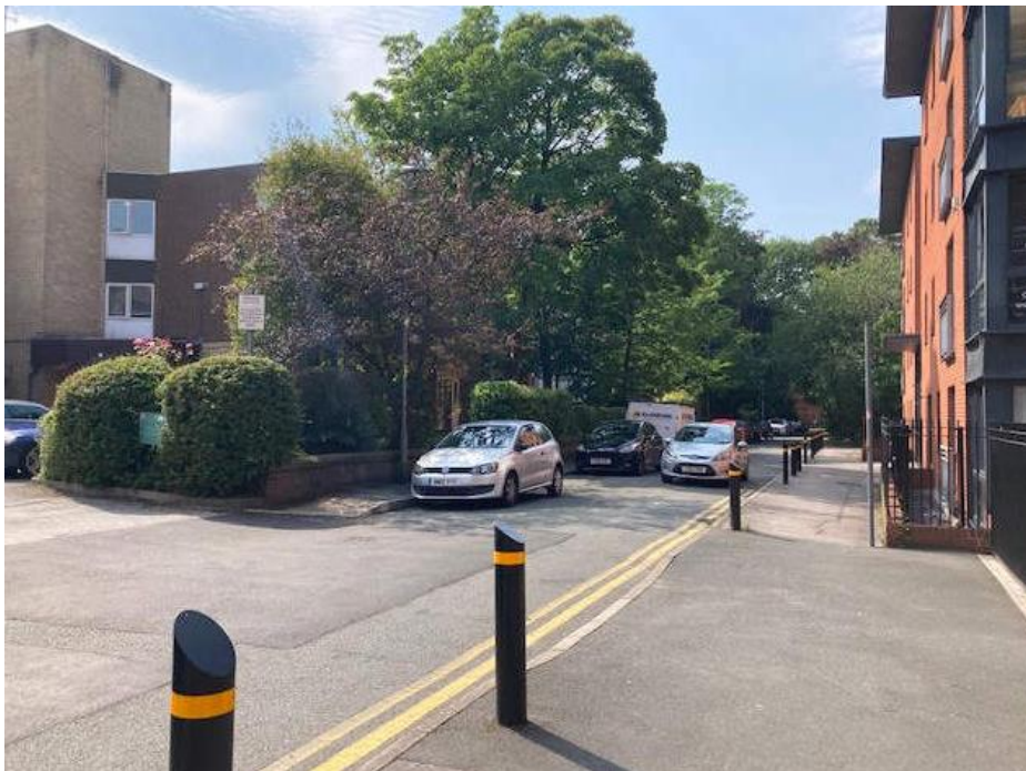
E. Residential properties part way down building road.