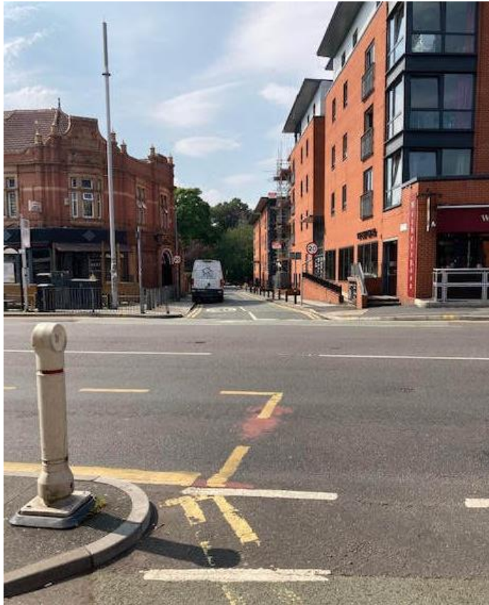
M. Top of Wynnstey Grove as seen from Wilmslow Road