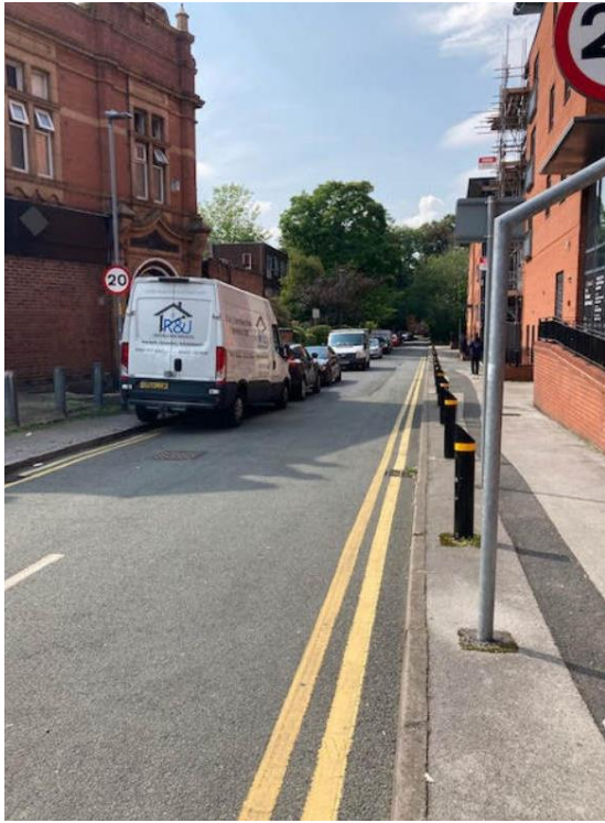
D. View along Wynnstay Grove (from Wilmslow Road). Licensed Premises on both sides of the road.