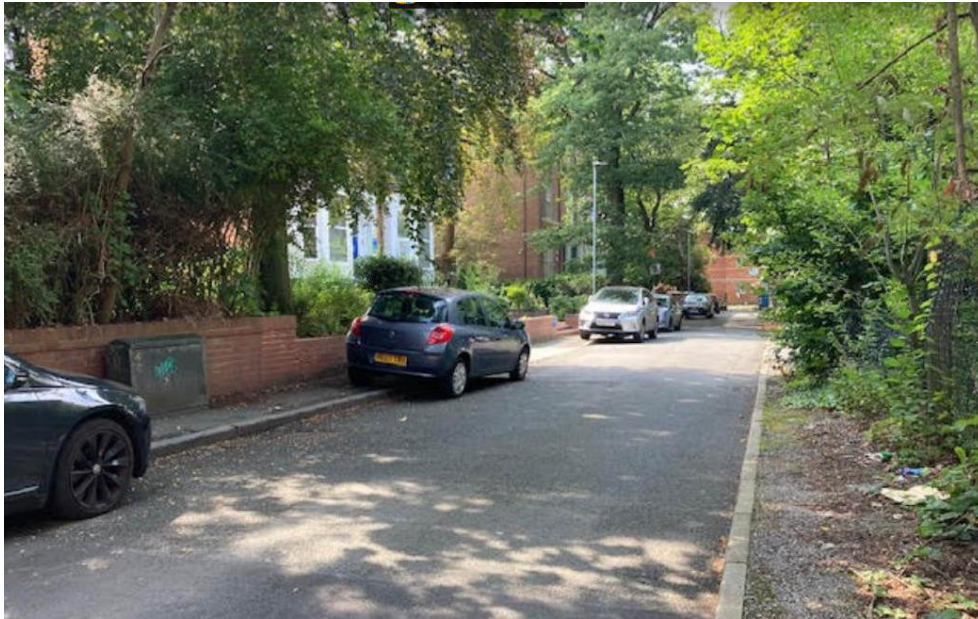
F. Marie Stopes Clinic UK (white building on the left). Entrance to the staff / visitor car park is just in between where the grey and white vehicles are parked.