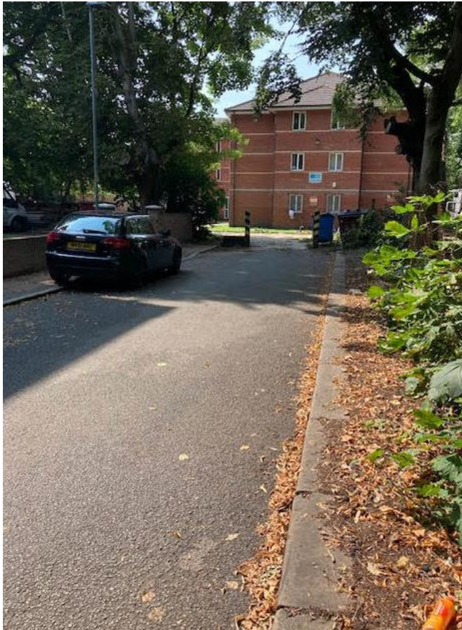
J. End of Wynnstay Road. No through road. Road leads to car park of private residential apartments.