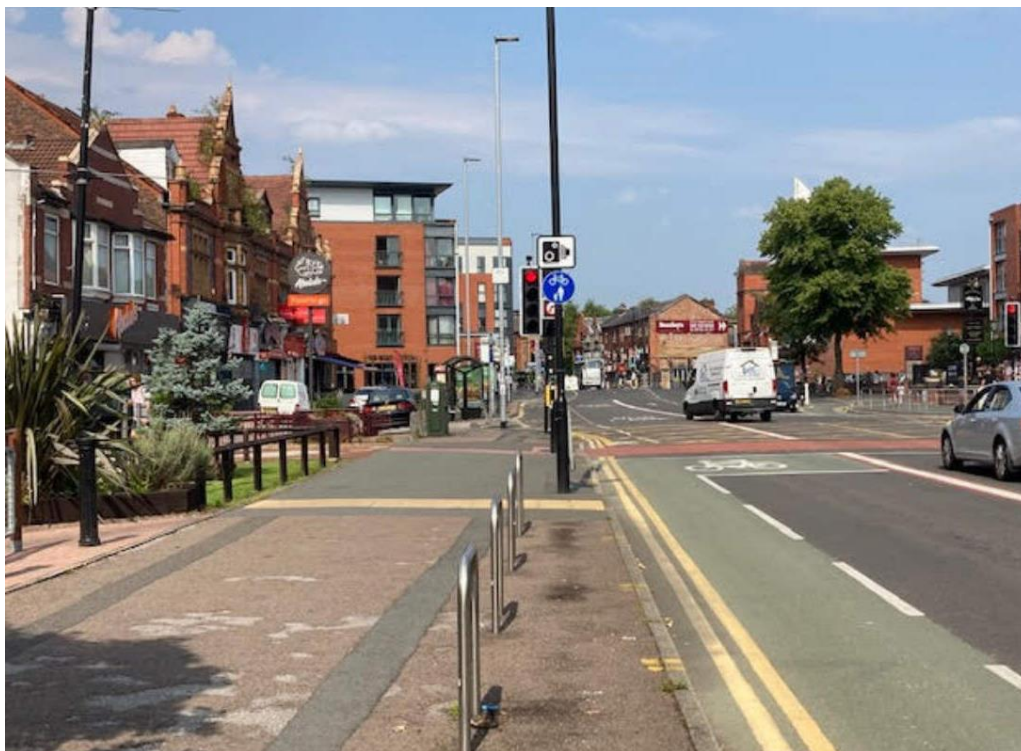
A. Wilmslow Road, from 336 to 310. Businesses, flats and bus stops