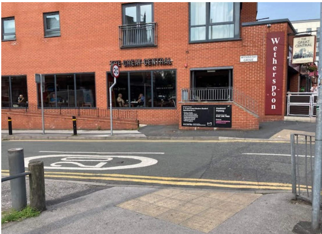
C. Entrance to Wynnstay Grove