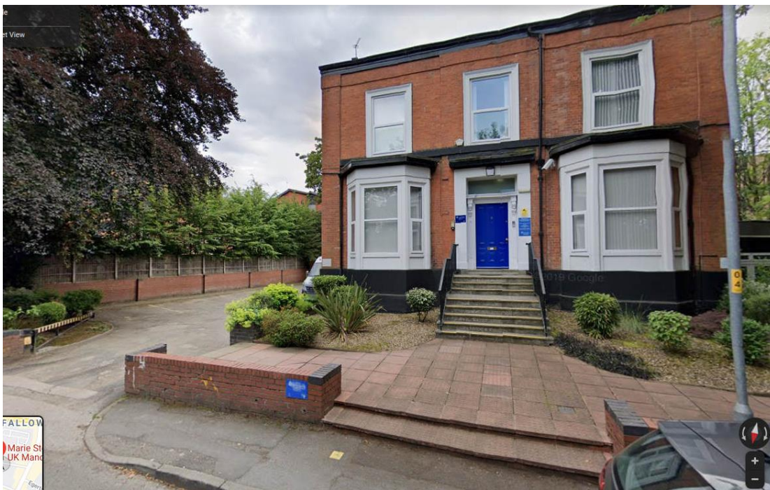
G. Front view of Marie Stopes Clinic UK (photograph taken from the internet). Staff / visitor car park is on the left. Blue door is the main entrance.